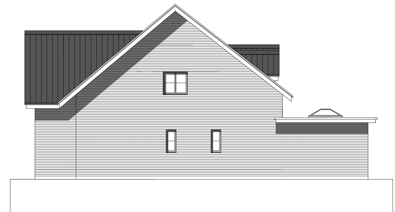
END - living