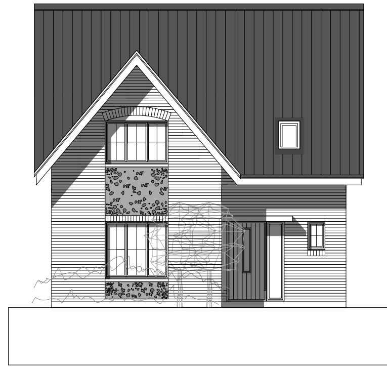
FRONT - unchanged