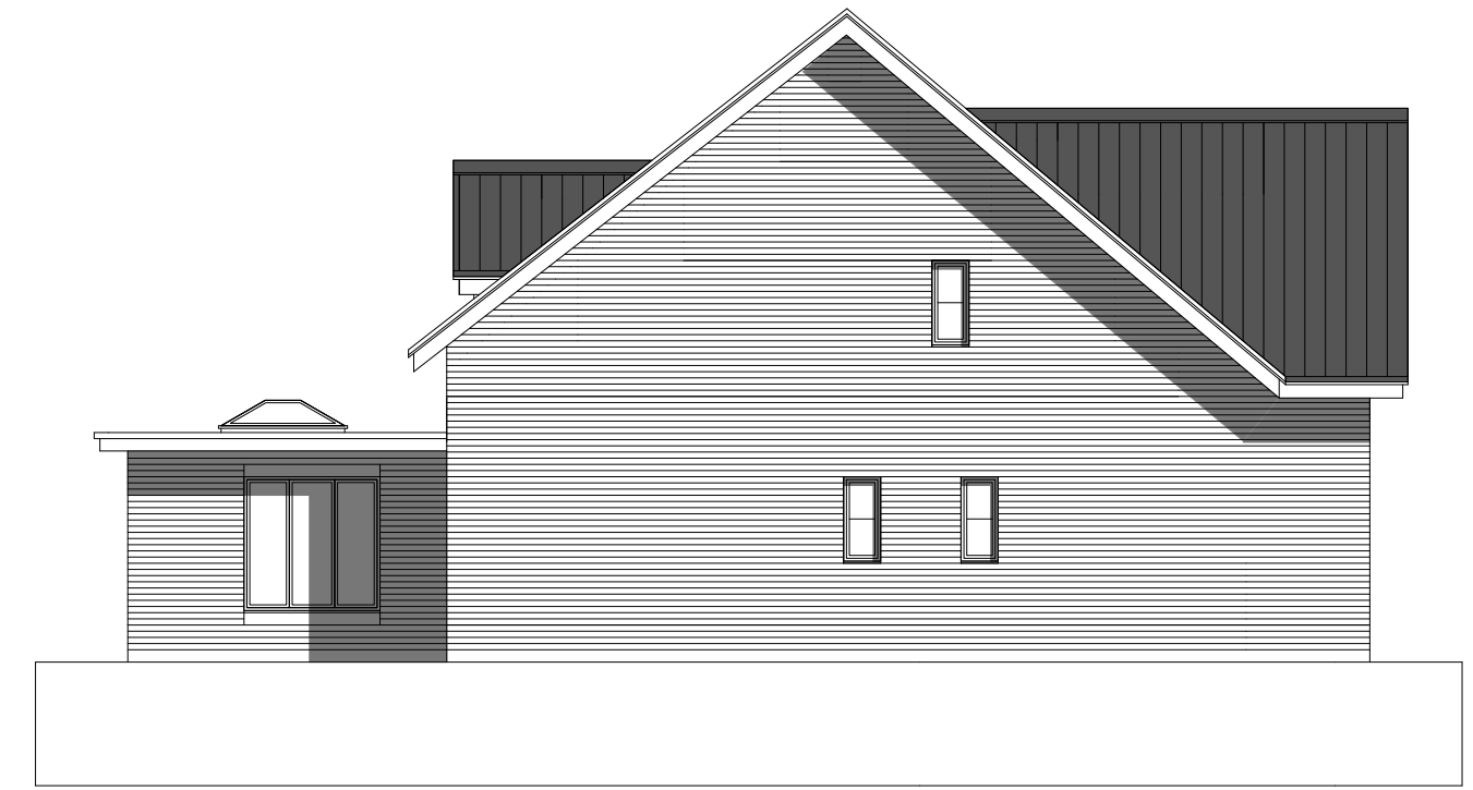
END - kitchen